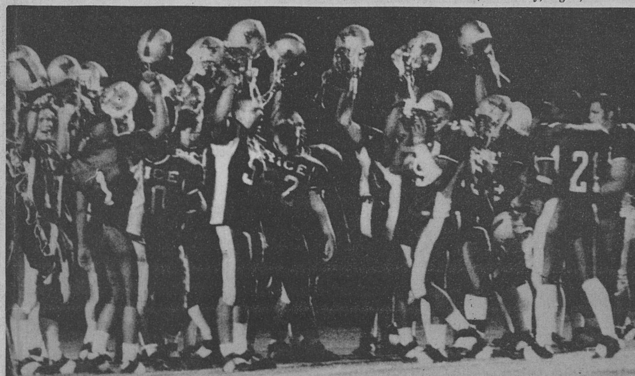
Following their 35-14 defeat of the Needville Bluejays, the Raiders gathered in the end zone for a celebration of their sixth consecutive victory this season and their second district win.